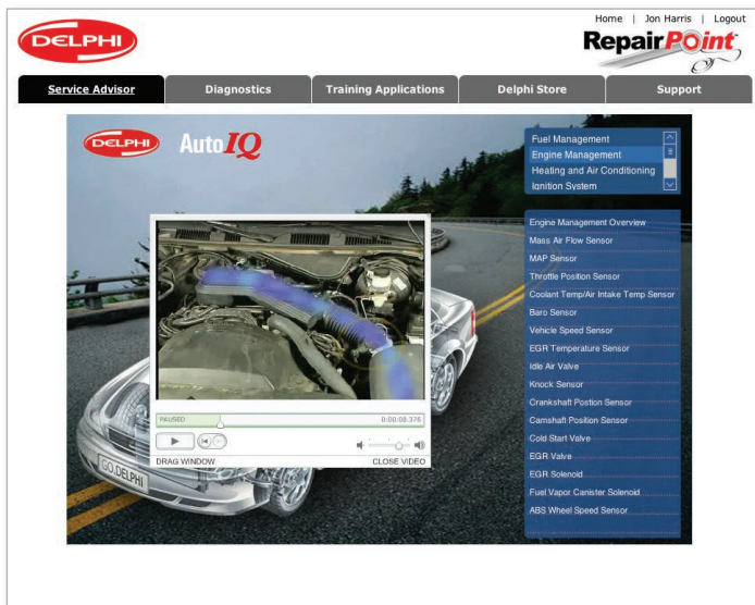
AutoIQ videos explain component functions in eight major vehicle systems